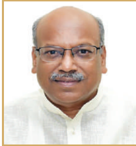
Sanjay Shamrao Dhotre Minister of State for Human Resource Development

India aspires to become a 5 trillion dollar economy in a near future. To reach this mark, it needs to evolve system and mechanisms to convert the present demographic dividend into high quality technical human resource, capable of doing cutting edge research and innovation, and deep-tech entrepreneurship. At this juncture, the MHRD's Innovation Cell and AICTE have brought out the 'National Innovation and Startup Policy 2019' for students and faculty.