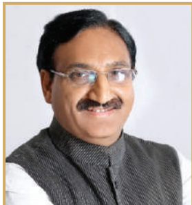
रमेश पोखरियाल 'निशंक' मानव संसाधन विकास मंत्री

स्टार्ट-अप इंडिया भारत सरकार की एक प्रमुख पहल है, जो नवीन आविष्कारों को हाथ में लेने, सहायता और प्रोत्साहनों के वित्त पोषण, उद्योग-शैक्षणिक भागीदारी और इन्क्यूबेटरों के बुनियादी स्तंभों पर आधारित है।